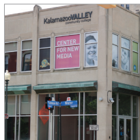
Center for New Media