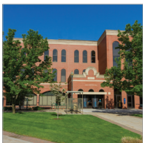
Anna Whitten Hall