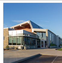
Food Innovation Center