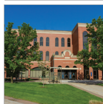
Anna Whitten Hall