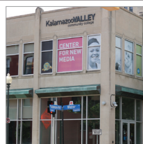
Center for New Media