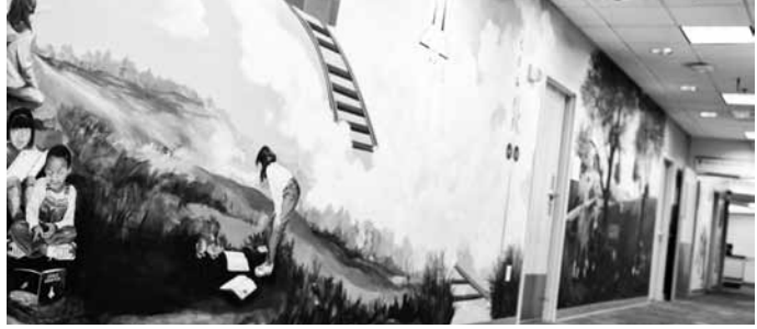
A large mural in the Children's Hospital at Bronson.