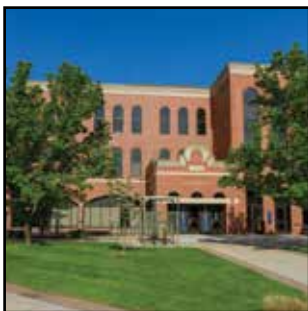
Anna Whitten Hall