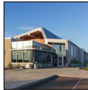
Food Innovation Center