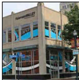
Center for New Media