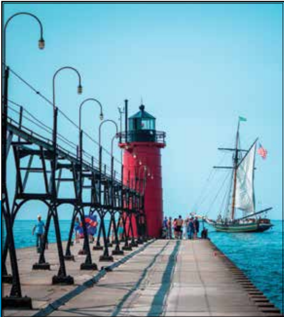
SOUTH HAVEN PIER