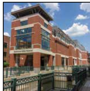
Kalamazoo Valley Museum